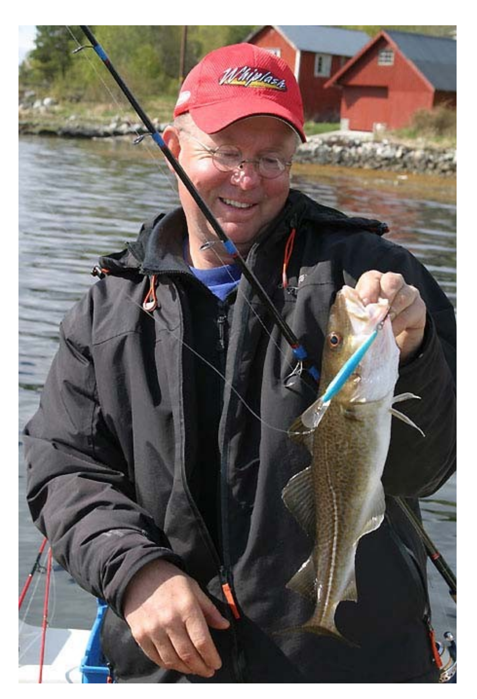
On the DDHJ from Rapala it was fish After fish.

The water near Nesoya Brygger is incredible deep and in the summer there are really big ling to catch at more than hundred meters of water. Also really big cod and coalfish are the fish to catch. We go for all of these three fish at 40 meters. After ten minutes and just a nice pollack