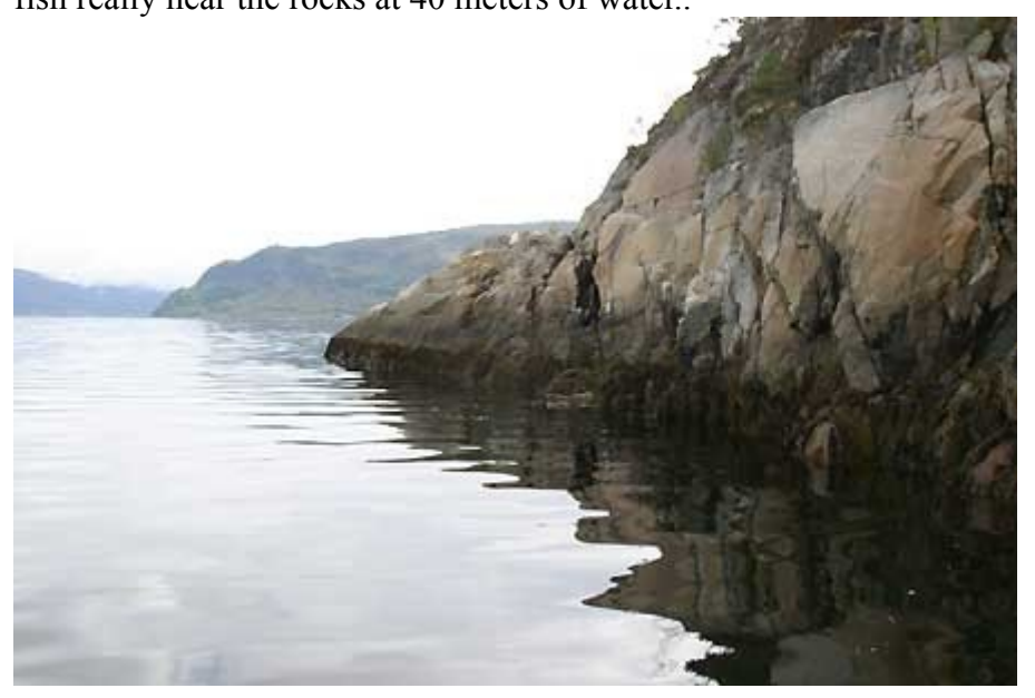
Fishing so close to the rocks i have never seen it before.

Ronald is catching there a nice coalfish from two kilo. I keep on fishing with a large rubber shad but unfortunately no fish is taking it. We decide to go on to the head of the Island and we fish really near the rocks at 40 meters of water..