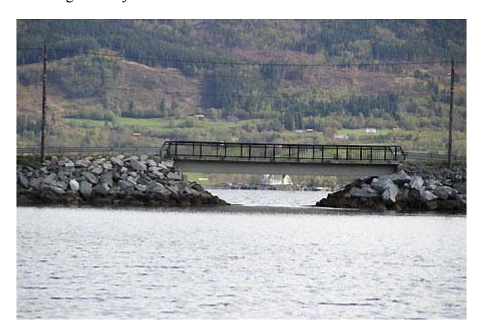
We caught on both sides of the bridge a lot of cods at 7 meter of depth.

Ronald is hooking a nice cod again but when the fish is nearly in the boat the gets free We fish along to the other side of the island till the bridge and we get no bite at all. Than we go under the bridge and try it to the other side.