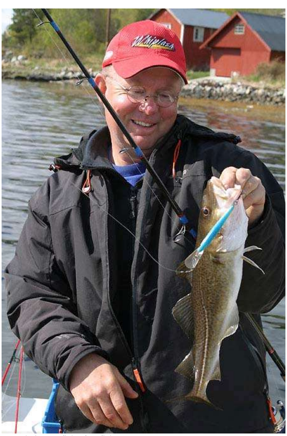
On the DDHJ from Rapala it was fish after fish.

jacket I left at home. He goes away and he returns with a fantastic black jacket which you see a lot in the winter sports. It was from his son, but he did not wear it anymore. Really a great solution.