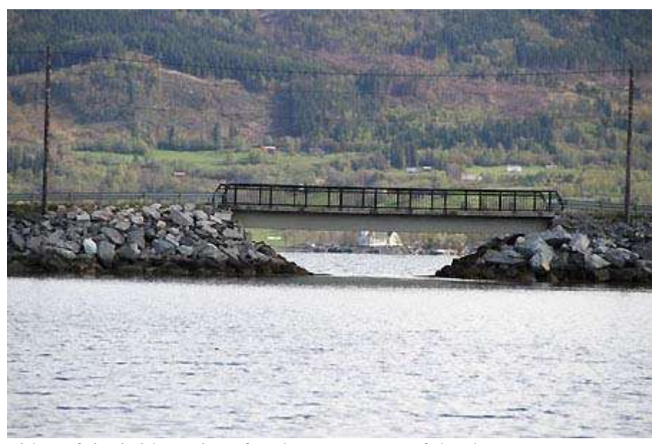
We caught on both sides of the bridge a lot of cods at 7 meters of depth.

Ronald is hooking a nice cod again but when the fish is nearly in the boat it hooks off the angle. We fish along to the other side of the island, but we get no bite at all. Then we go under the bridge and try it to the other side.